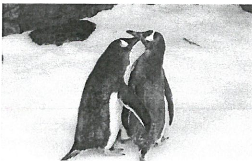
Sphen and Magic had caught the attention of aquarium workers when they were constantly seen waddling around and going for swims together

The yet-to-be-named sub-Antarctic penguin chick was born on Friday, October 19 weighing just 91 grams (3.2 ounces).